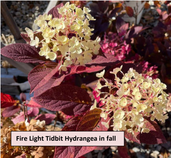
Fire Light Tidbit Hydrangea in fall

Fire Light Tidbit® Hydrangea is the smallest and easiest of the hardy hydrangea and better still, packs a big punch of color. Large, lush panicles of white mophead flowers appear in early-mid summer, nearly hiding the lovely green foliage. As the summer progresses, they begin to develop bright pink and red tones, which keep it colorful right on up to the first frost. As fall begins, the leaves turn an amazing crimson as the flowers become white with pink centers. Amazing and beautiful! Thick, sturdy stems help to create a neat, mounded plant that's fantastic in landscapes and flower gardens.